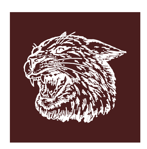
WILDCAT1CWHITE (shown on maroon background)